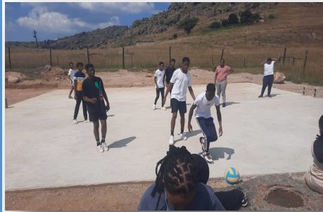
Volleyball and basketball