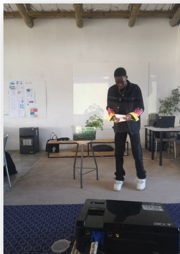
Student led parent conferences presenting academic work