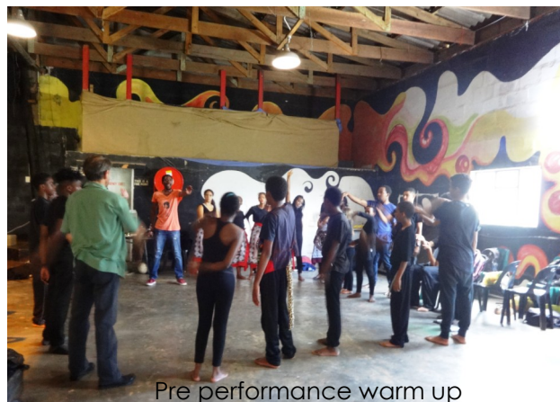
Pre performance warm up