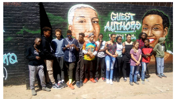
Mural - Johannesburg Arts trip travelling classroom

Please note that those students who are unable to go on the trips must still attend school as there will be alternative activities planned.