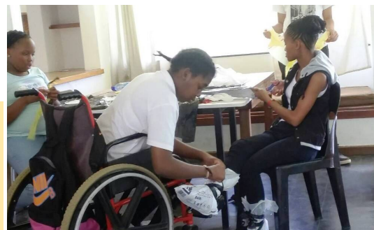
Day 2 of Orientation