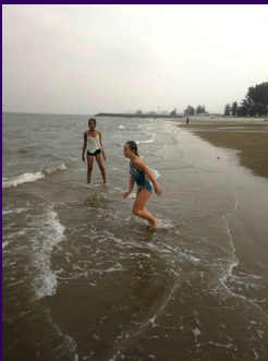
On the beach in Maputo