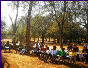
Outdoor travelling classroom Hlane