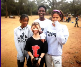
Tree planting and face painting!