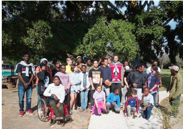
At this intercession, aside from team building and witnessing a